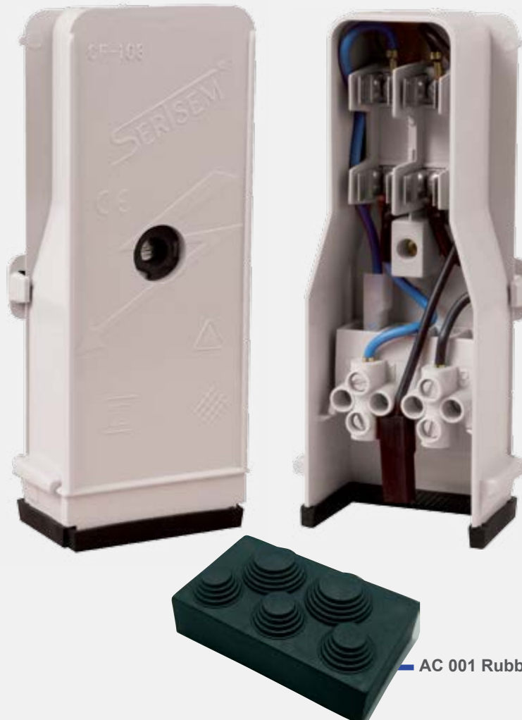
AC 001 Rubber Gland.